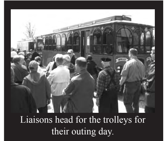
Liaisons head for the trolleys for their outing day.